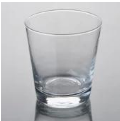
drinking glass water cup