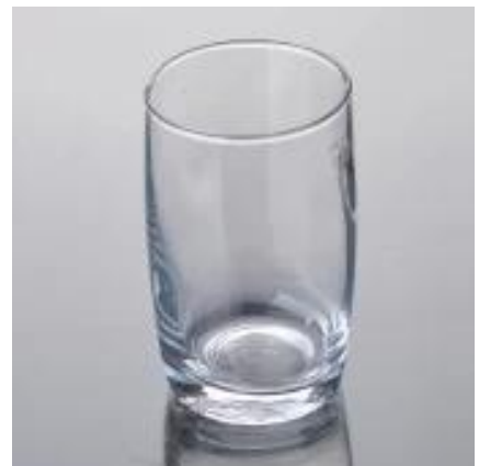
8oz highball glass