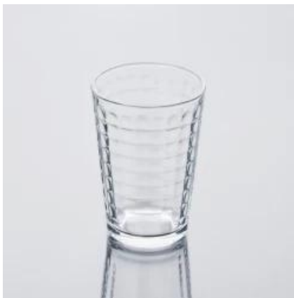
cheer Recyled glass tumbler