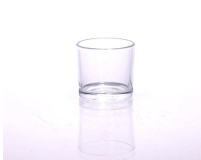
machine made glass candle holder