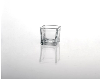
square clear glass candle holder