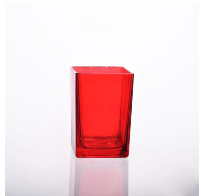
spray color glass candle holder