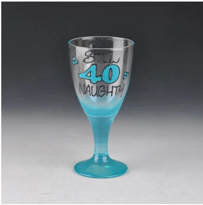
hand painted margarita glass