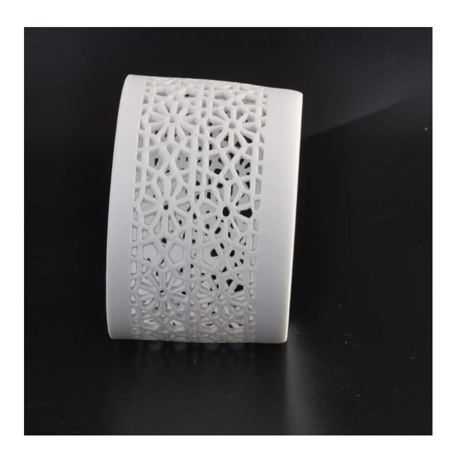
Custom Design Is Available As Below Examples