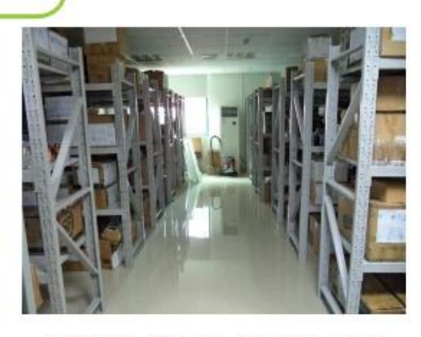
4,000+ Items for Choice