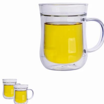
New Borosilicated Double Glass Tumbler with Hand