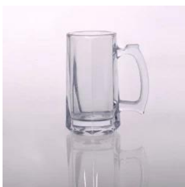
Machine made 360ml large beer glass mug