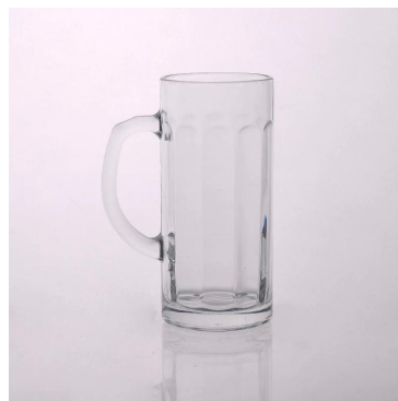
14oz glass beer mug