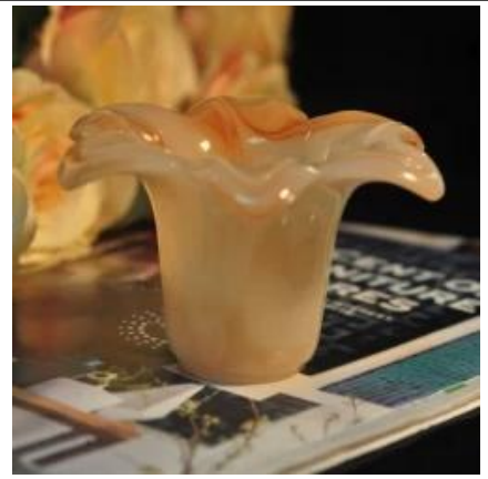
Flower shape amber colored jade cylinder decorative glass candle jar candle holder