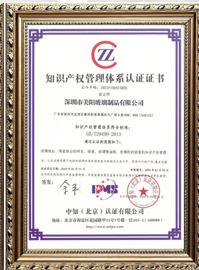
Hartanah Intelektual Syarikat