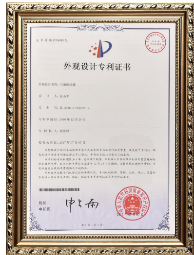
Nombor paten: 201630655323.4