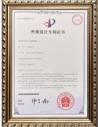
Nombor Paten: 201630655323.4