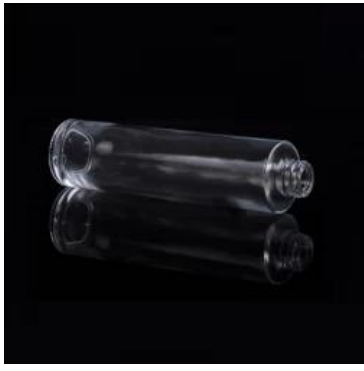
Wholesale glass diffuser bottle