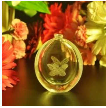
elegant laser heart glass perfume bottle