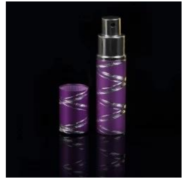
purple colored perfume glass bottle