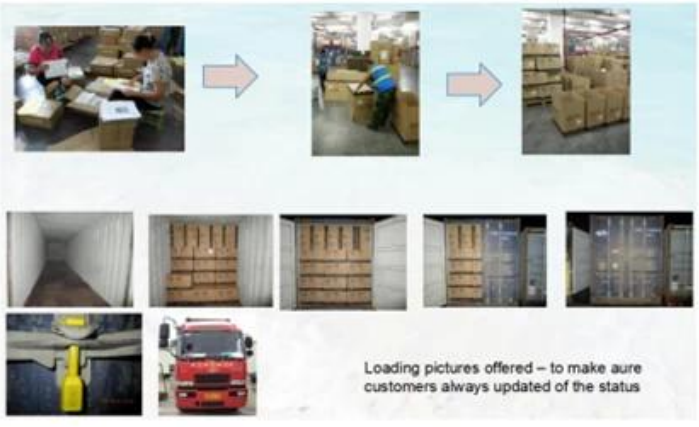
Loading pictures offered – to make sure customers always updated of the status