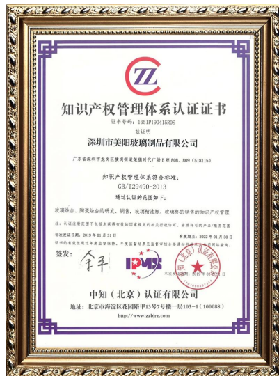
Harta Inteltek Perusahaan