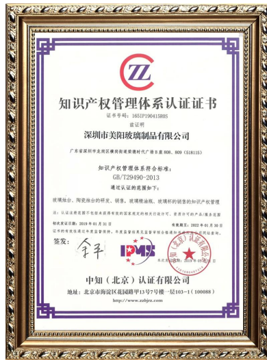
Hartanah Intelektual Syarikat