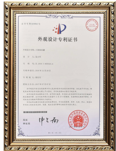
Nombor Paten: 20163065532.4