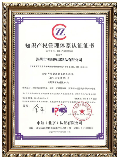
Harta Inteltek Perusahaan