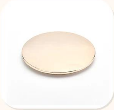
Zinc Alloy Cover