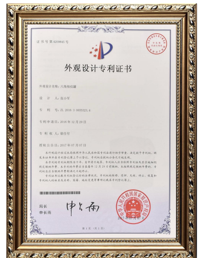
Numero di brevetto: 201630655323.4