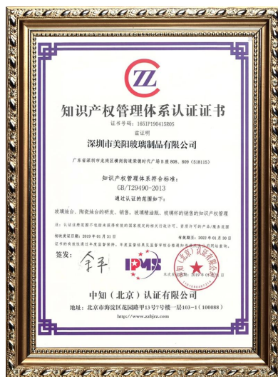
Propriété intellectuelle des entreprises