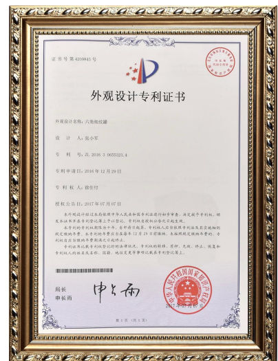
Numéro de brevet: 201630655323.4