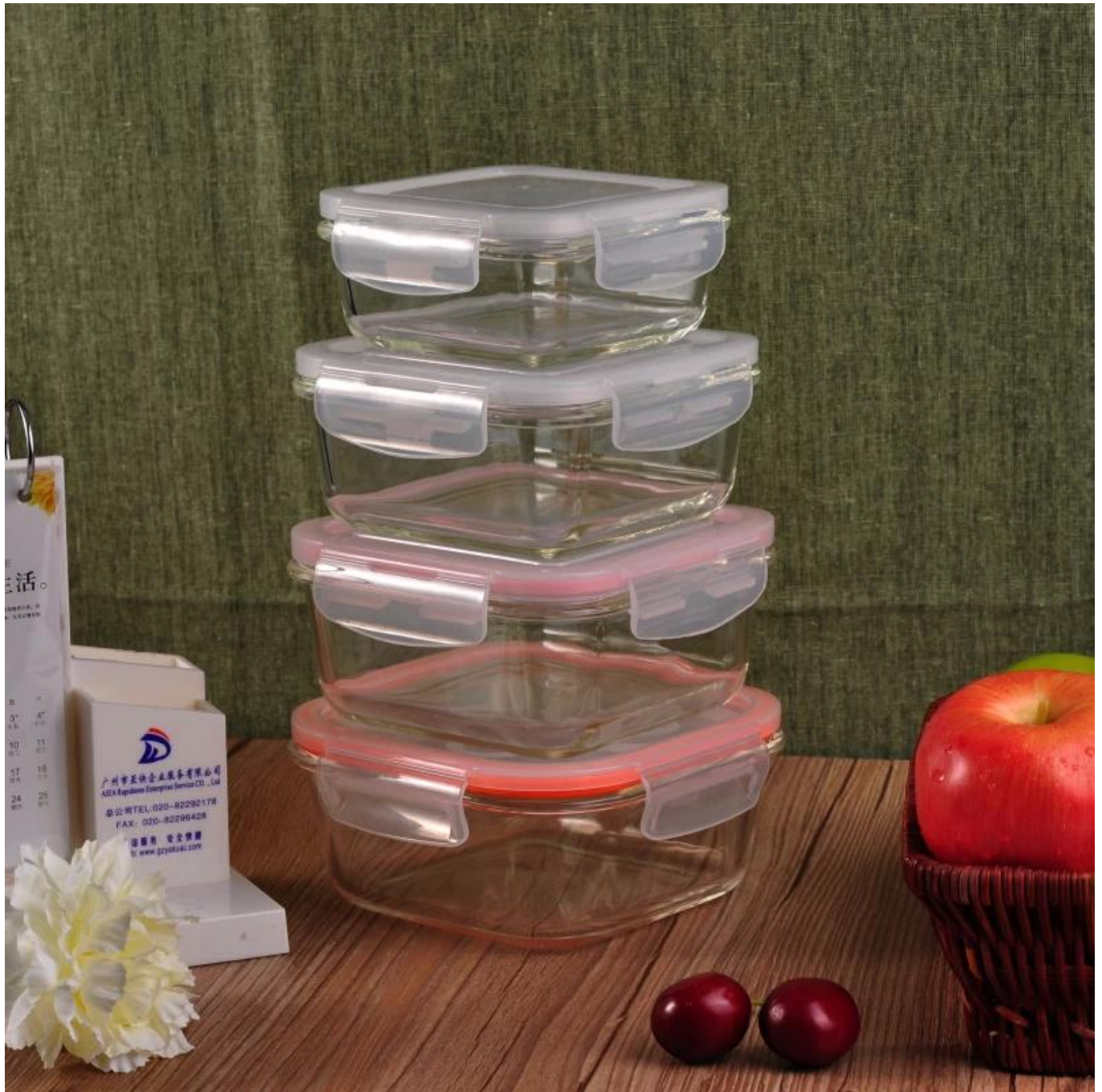
Different shapes and color of meal boxes for your choice.