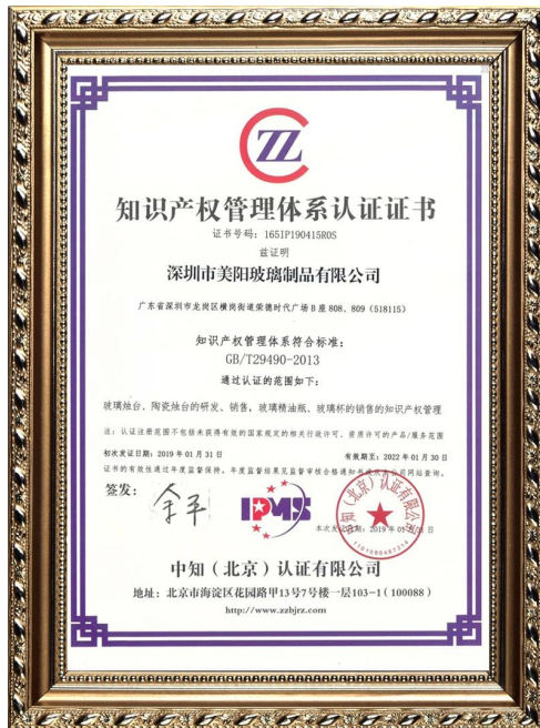
propiedad intelectual empresarial