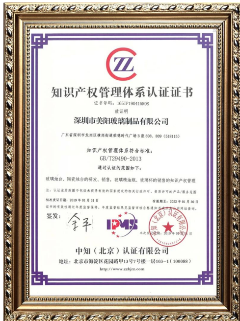
Geistiges Eigentum von Unternehmen