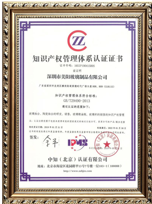
Geistiges Eigentum von Unternehmen