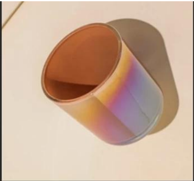
200% 11.25 cm x 12.86 cm (144 ppi) Captura de Pantalla 2022-02-13 a las 21:48:34.png @ 190% (Layer 1, RGB/8*)