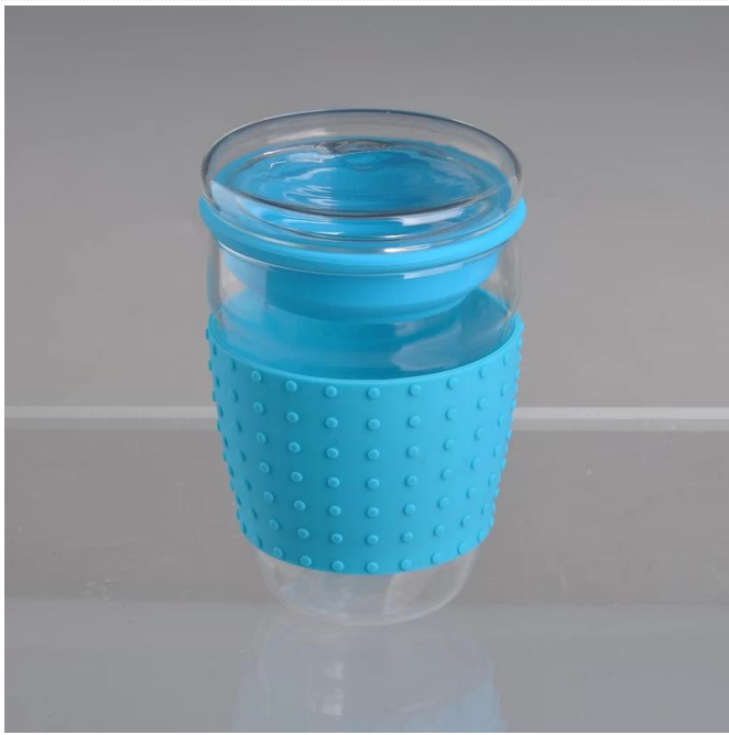
borosilicate glass cup with silicane